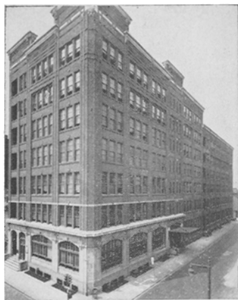
◀ Main Building